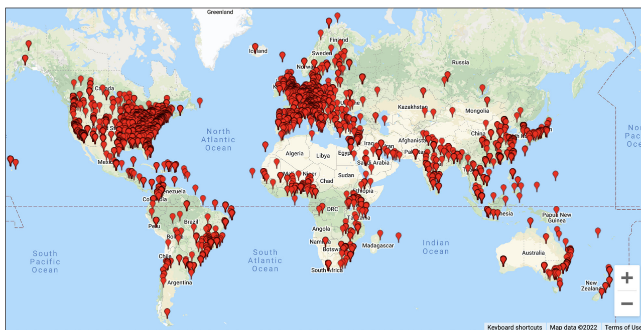
Figure 1: Map of REDCap consortium members.

The instrument metadata describing both the CDASH Foundational eCRFs and the Crohn's Disease eCRFs are in a CDISC format called the Operational Data Model (ODM-XML). ODM-XML is a vendor-neutral machine-readable